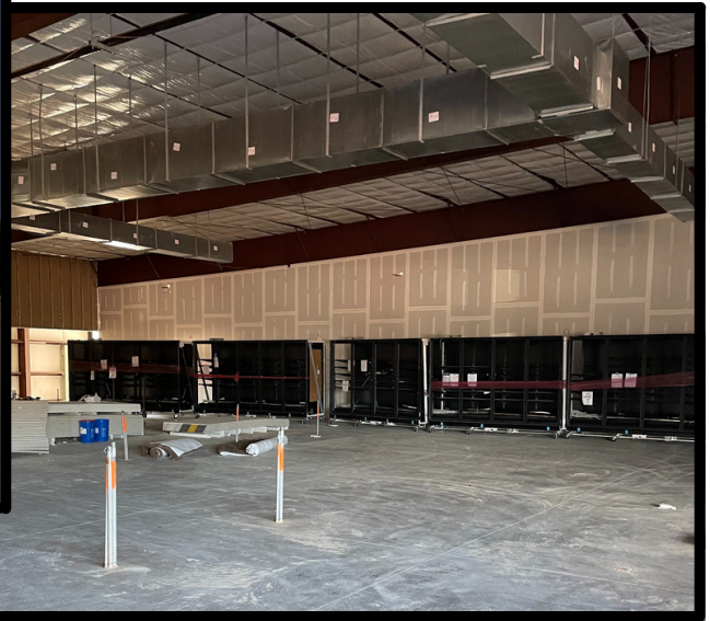
Fastimes - Whiteville, TN