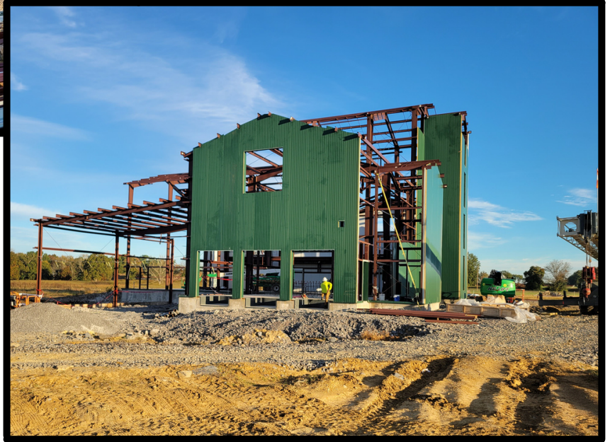
Uncle Nearest Distillery - Shelbyville, TN