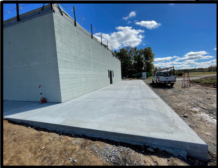
Choctaw Covid Center - Henning, TN