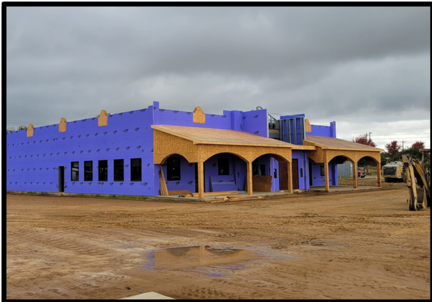
Margaritas - Millington, TN