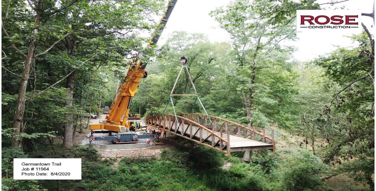
Germantown Greenway Trail July 2020 Germantown, TN