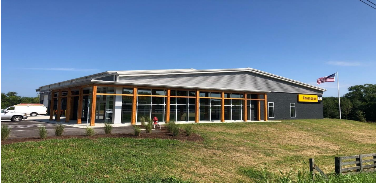
Thompson Machinery in Thompson Station, TN