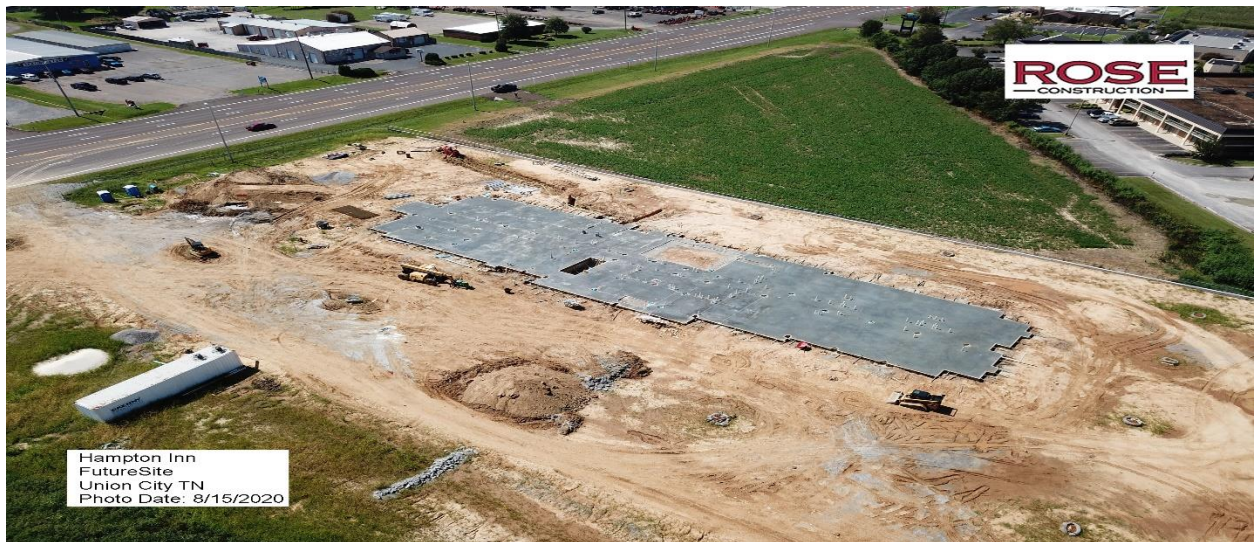
Future Site of Hampton Inn Union City, TN