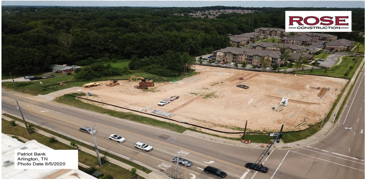
Patriot Bank Jobsite in Arlington, TN