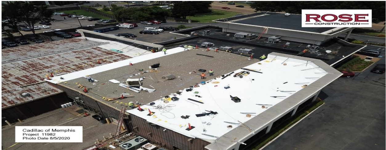
Landers Cadillac of Memphis. Memphis, TN