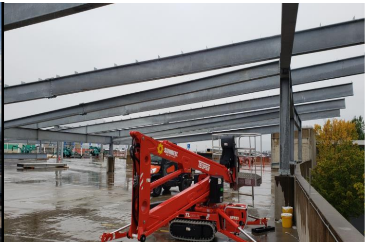
Crews install structural frames for solar panels on the top deck of the parking garage at BlueCross BlueShield Corporate Office in Chattanooga, TN for our client Light Wave Solar.