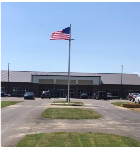
The American flag waves proudly in front of the newest Tipton Christian Academy building.