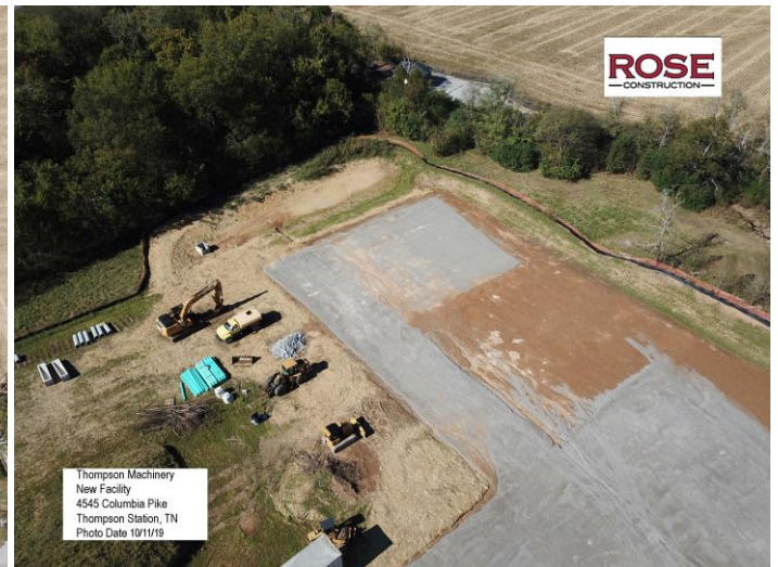
Work continues in Thompson Station, TN at the site of the new Thompson Machinery.