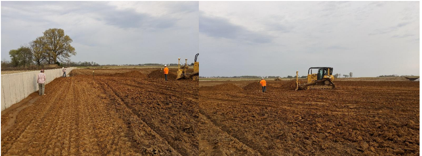
Hampton Inn (CMI) Project - Union City, TN