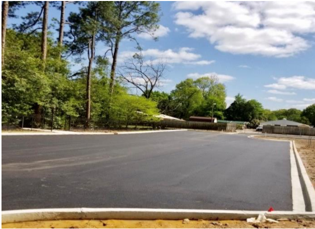
Memphis Botanic Garden Memphis, TN April 2020

A few other projects currently underway at Rose Construction, Inc. include: