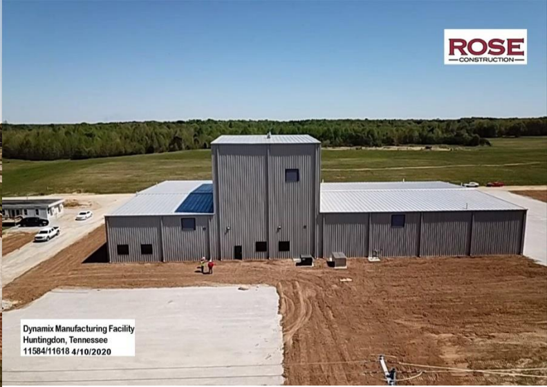
Dynamix in Huntingdon, TN April 2020