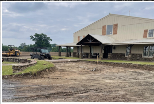
Island 34 Renovations Lauderdale County