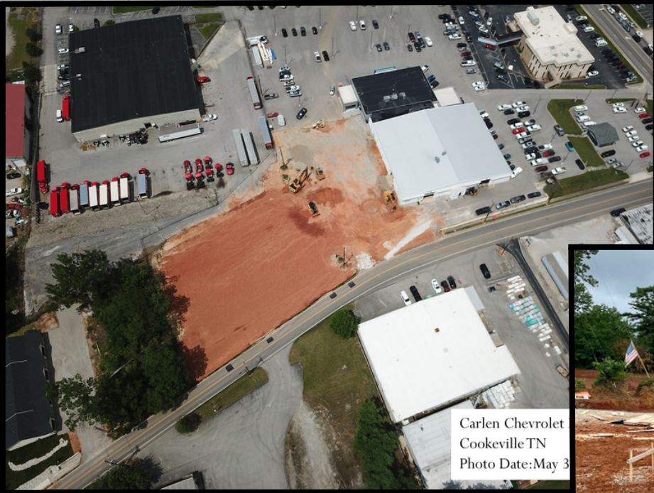
Carlen Chevrolet Cookeville TN Photo Date: May 3