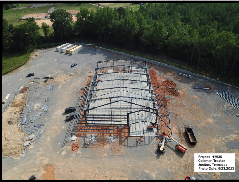
Project 12936 Coleman Tractor Joelton, Tennessee Photo Date: 5/23/2023