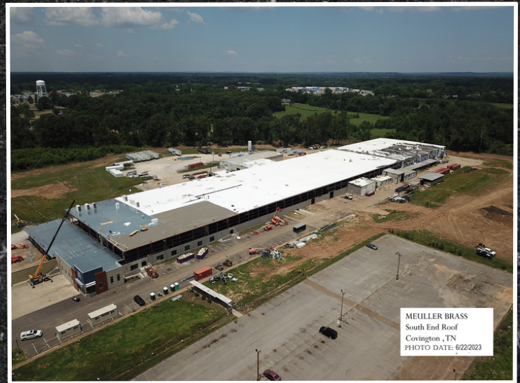
Mueller Brass Roof Restoration Covington, TN