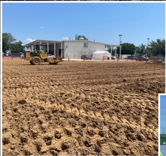
ICON Collision Expansion Memphis, TN