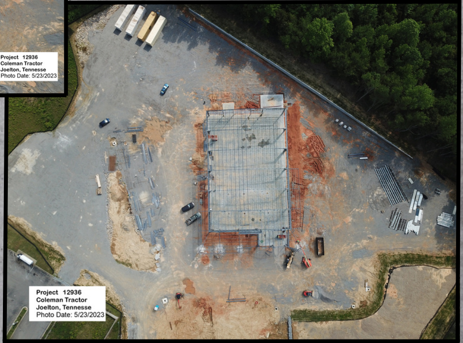
Project 12936 Coleman Tractor Joelton, Tennessee Photo Date: 5/23/2023