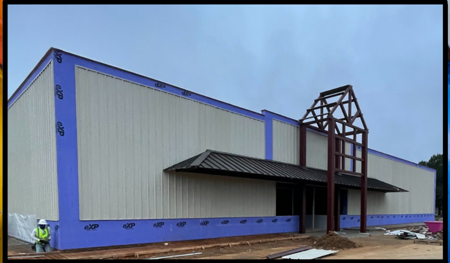
FASTIMES- WHITEVILLE, TN