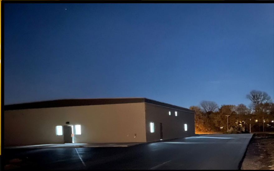
YATES CHOCTAW COVID CENTER- HENNING, TN