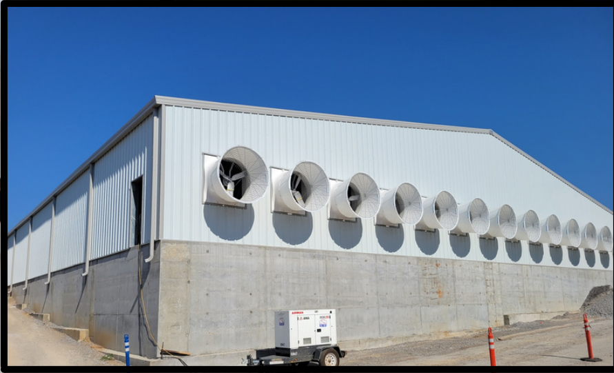
TYSON FACILITY - NEWBERN, TN