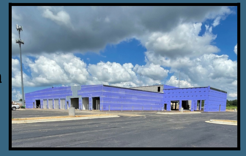
Pictured Left: Lou Sobh Honda of Southaven Southaven, MS