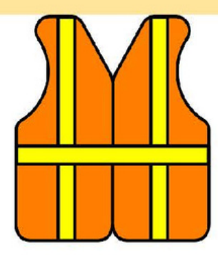
Safety! Safety! Safety! We hear that word all the time, especially in our Construction environment. But, why?

Have you ever been hurt? At work or at home? First of all... it hurts! Whether you cut yourself with a paring knife at home, or hit your toe on a piece of furniture, or got your fingers pinched, or whacked your head, or got something in your eyes... it hurts! And none of us like to hurt. PPE is there to keep us from getting seriously hurt.