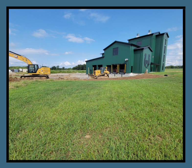
Pictured Left: Uncle Nearest Distillery Shelbyville, TN

Pictured Right: Total Fitness Covington, TN